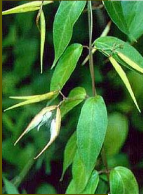
Dog-strangling vine: Grrr! Learn to identify it and then eradicate it!